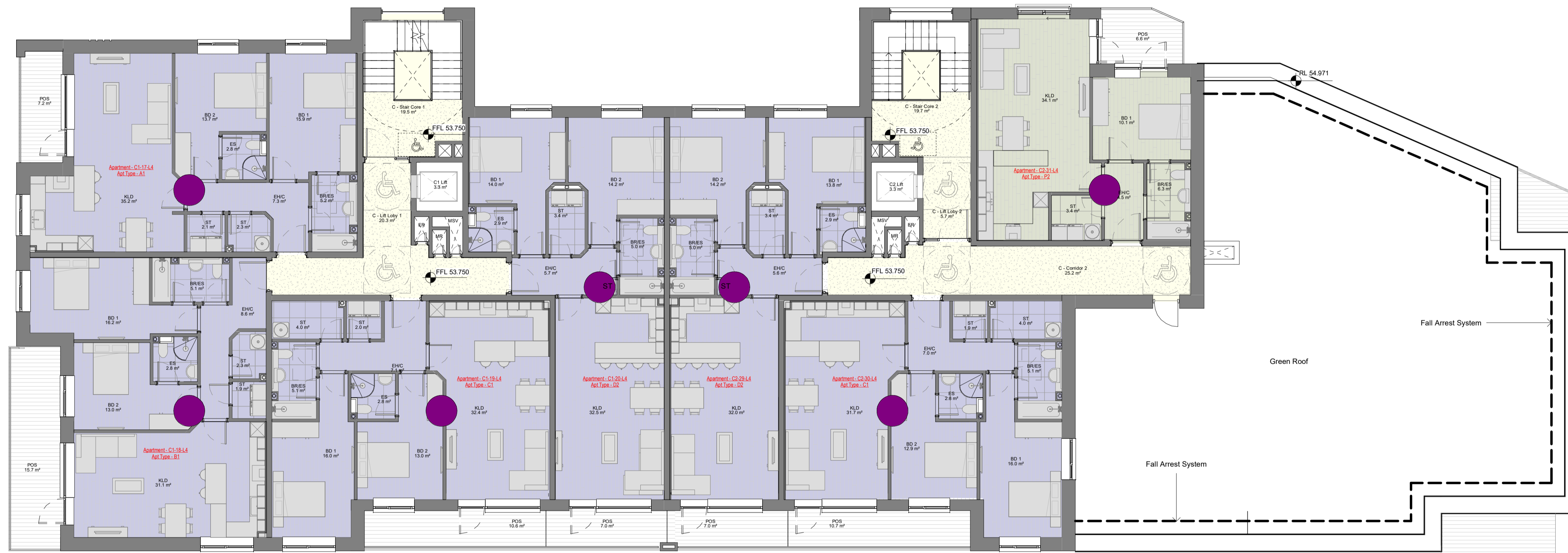
1 GA PART V - Fourth Floor Plan 1 : 100